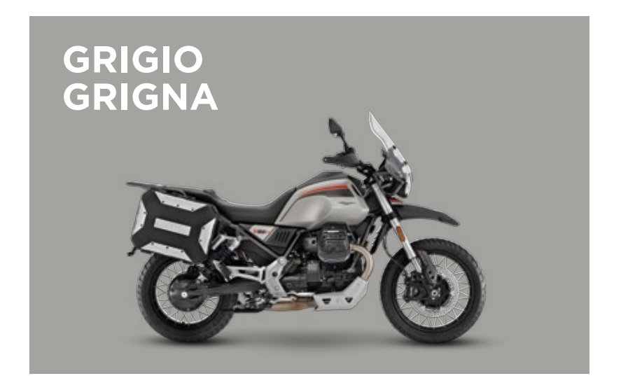
V85 TT TRAVEL