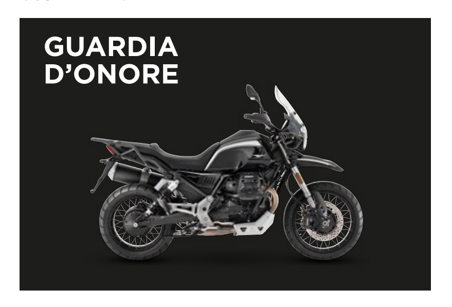
V85 TT GUARDIA D'ONORE

V85 TT IS AVAILABLE WITH BRAND-NEW GRAPHICS, CAREFULLY DESIGNED TO ACCENTUATE THE MODEL'S EVERY CURVE AND STYLE DETAIL. THESE INCLUDE NERO ETNA, GIALLO MOJAVE, VERDE ALTAJ AND THE UNIQUE ROSSO ULURU. V85 TT TRAVEL FEATURES THE EXCLUSIVE GRIGIO GRIGNA COLOUR SCHEME.